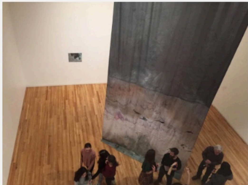
"The year of the whale", exhibition opening views, 2018