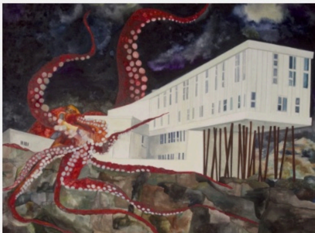
Isa Melsheimer, Nr 437 , 2017, gouache on paper

The layered, multiview-point imagery of the curtain conveys a feeling of the immensity of the ocean, as well as the passage of time, thus criticizing the all-knowing and domineering attitude towards nature typical of the Western tradition. Additionally, four gouaches on paper depict iconic brutalist buildings emerging from dramatic darkened or red-infused skies and encroached by massive sea creatures - a reflection on human structures amidst an environment that is at once threatening and fascinating.