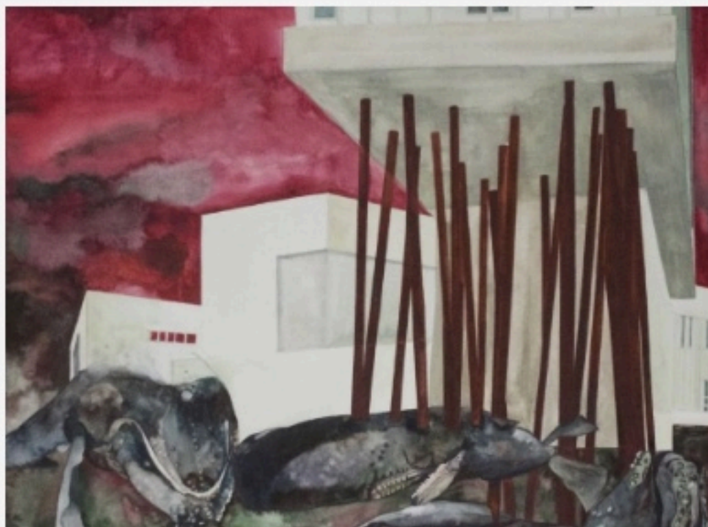
Isa Melsheimer, Nr 438 , 2017, gouache on paper

The layered, multiview-point imagery of the curtain conveys a feeling of the immensity of the ocean, as well as the passage of time, thus criticizing the all-knowing and domineering attitude towards nature typical of the Western tradition. Additionally, four gouaches on paper depict iconic brutalist buildings emerging from dramatic darkened or red-infused skies and encroached by massive sea creatures - a reflection on human structures amidst an environment that is at once threatening and fascinating.